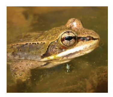
As the days get longer and the nights warmer, amphibians rise from their

winter slumber and begin their quest for a mate. Among the most vocal are the Wood Frog and Spring Peeper. The Wood Frog is one of the first to appear because it can tolerate colder temperatures. The Northern Spring Peepers are smaller tree frogs with x-marks on their back. Both are identified by their mating calls, whose start is weather dependent. With a mild winter, you